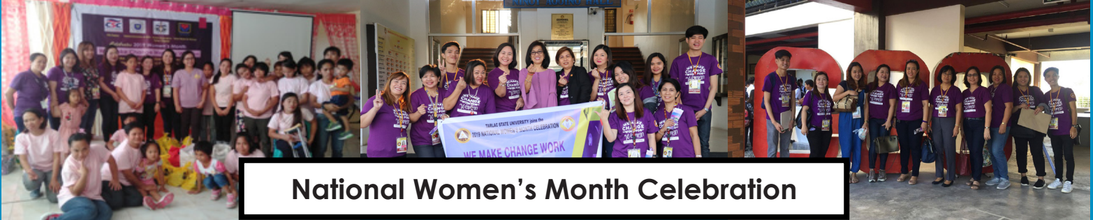
National Women's Month Celebration