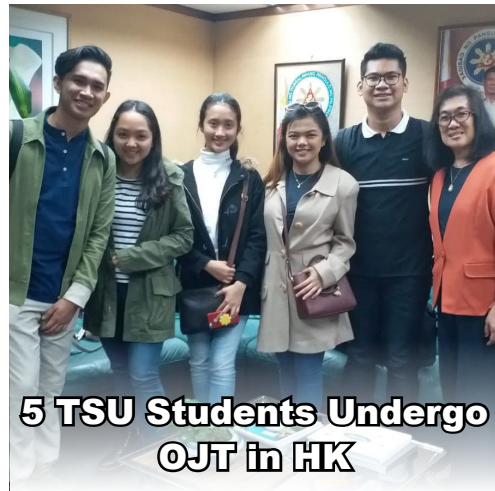
5 TSU Students Undergo OJT in HK