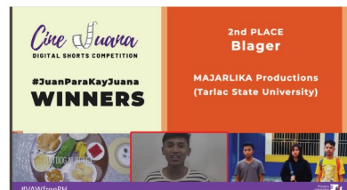
Comm Students win 2nd place in Cine Juana Digital Shorts Competition