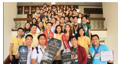
TSU-JPIA hailed as overall champion in the 23rd Regional Midyear Convention