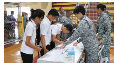
TSU, TOG 3 collaborates for Pushing Peace and Development