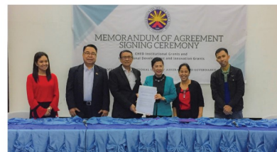
P5M CHED grant awarded to TSU CET Training Hub